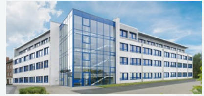
Headquarters Aachen, Germany