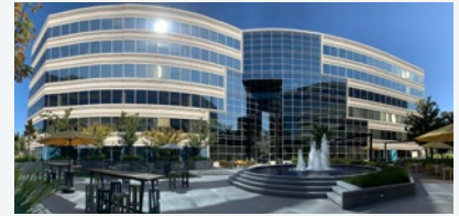
Headquarters Campbell, USA